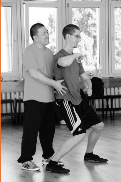
2016, Taiji Academy Magdeburg, Germany