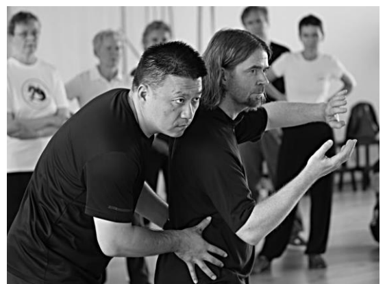
2018, Taiji Academy Magdeburg, Germany