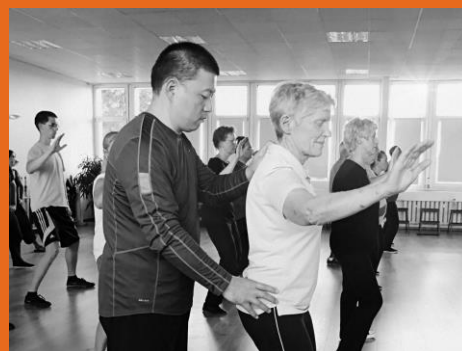
2016, Taiji Academy Magdeburg, Germany