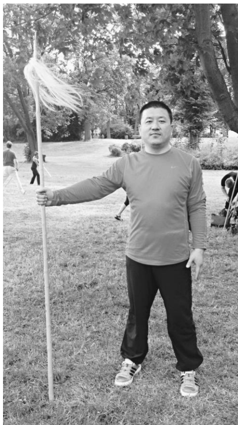
2017, Magdeburg, Germany,