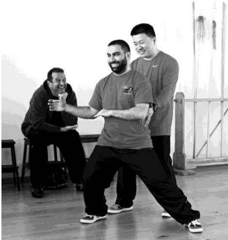
2017, Taiji Academy Magdeburg, Germany