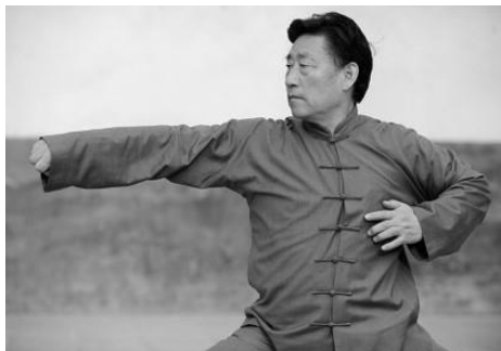
GRANDMASTER CHEN XIAOWANG, 19 TH GENERATION OF CHEN FAMILY