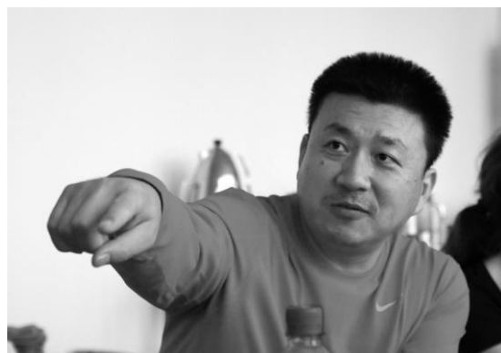
2017, Taiji Academy Magdeburg, Germany

There is something here, afraid of something, yeah. This man is funny. Life is life, you know, and I am just afraid I can not be a real master in my life.