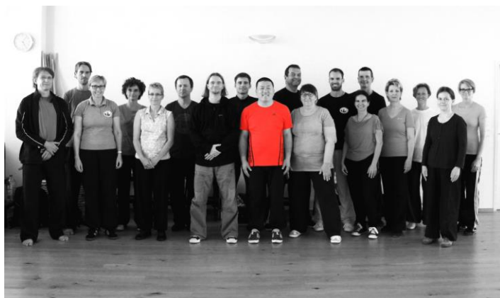
2015, Magdeburg, Germany