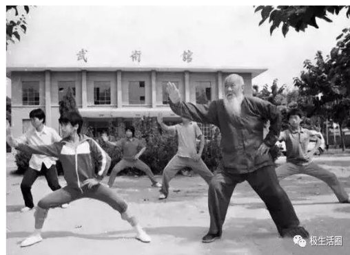
Taijiquan training in Chenjiagou