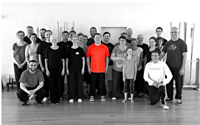
2016, Magdeburg, Germany

„ So, everybody can talk about theory, about the five levels, move your whole body all together, move you centre, . . . but a good master will try to show you theory in real. “